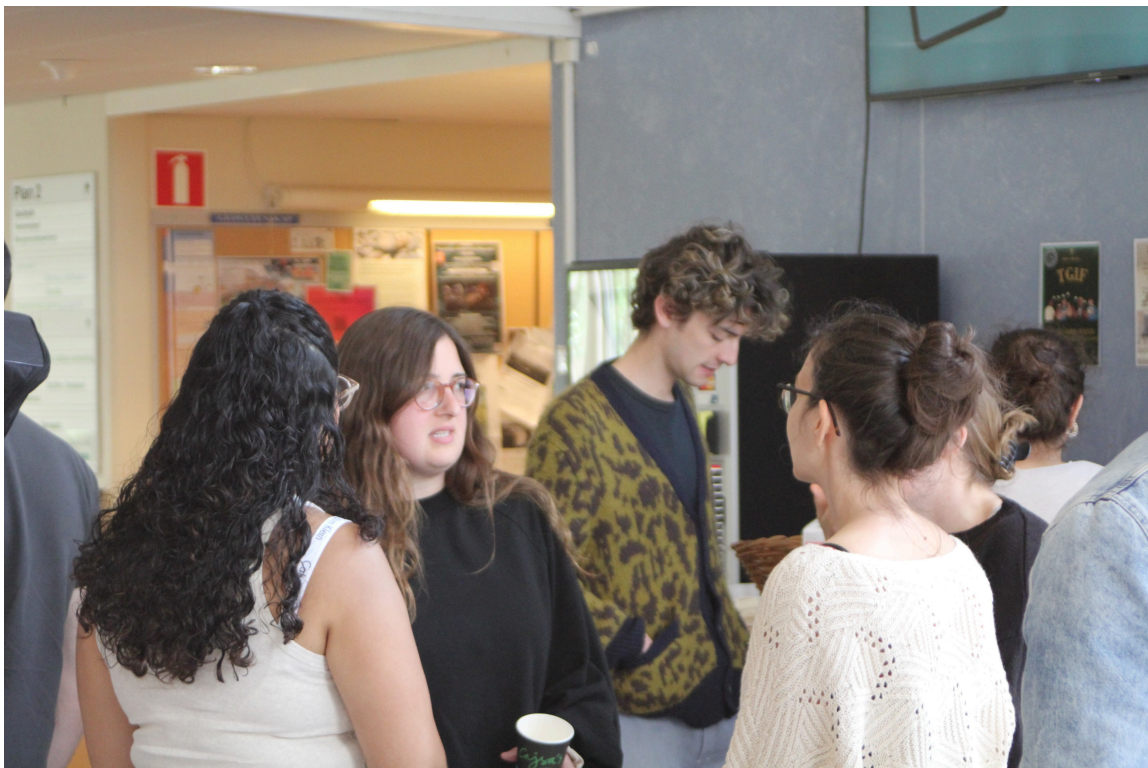
Some of the students of climes Summer School 2024 during a coffee break.