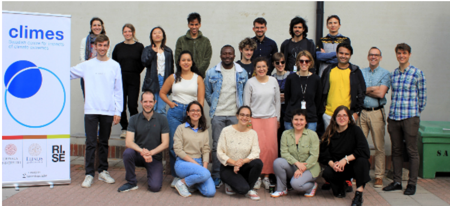
Group photo with students and some of the lecturers of the climes Summer School 2024..