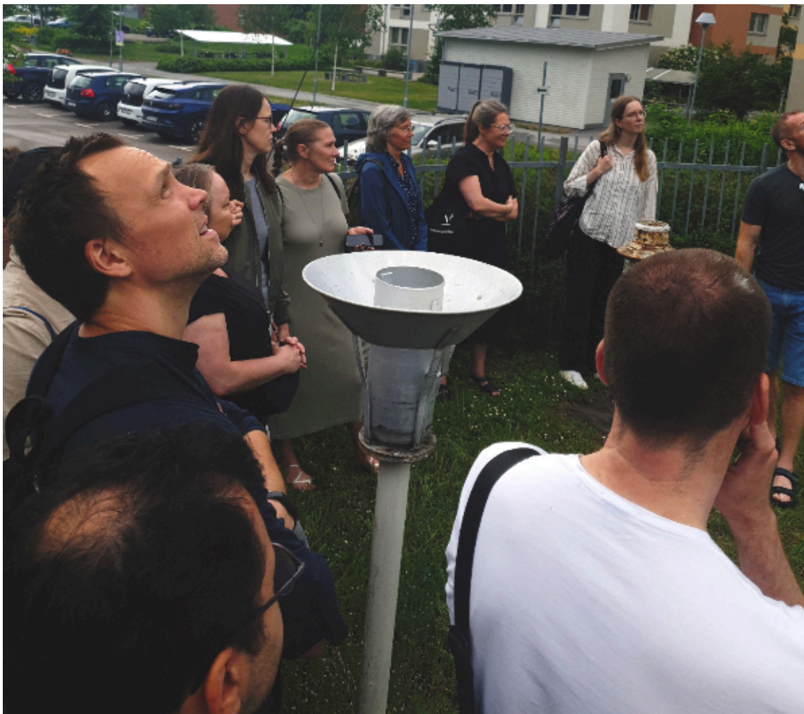
The representatives of Swedish Research Council during a tour to GeoCentrum's meteorology station.